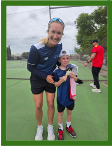
Harry participated in the State of Origin Super 10's Tournament