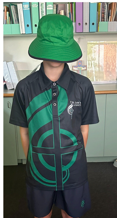
Sports uniform (McInerney version)