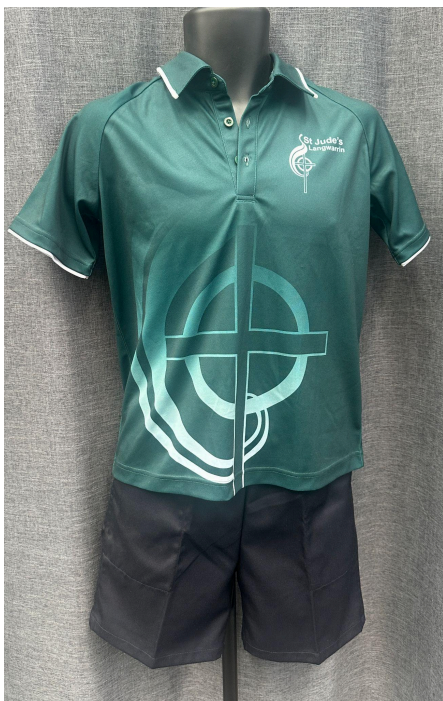
Everyday polo and shorts

I would like to thank all members of the parent uniform sub-committee, their input, time and enthusiasm has been invaluable.